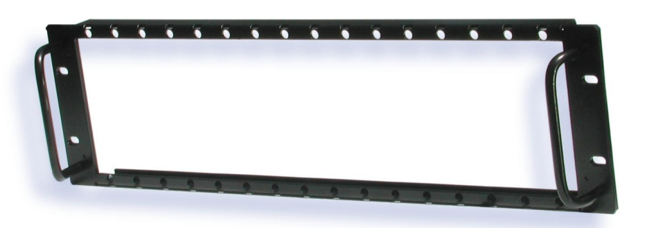
Model PF3000 Passive Module Frame

Aurora Network's model PF3000 3RU frame can be populated with up to 16 passive (unpowered) modules. This frame offers the network operator a simple platform with maximum flexibility and high packaging density for installation of all passive networking components such as muxes, demuxes and splitters.