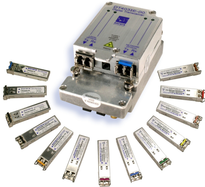
DT4032E with an array of some available SFP options (for transmission at 1310nm, 1550nm, or CWDM wavelength)

Aurora Networks' DT4032E Digital Transceiver is a component of Aurora's Integrated Digital Transport System that combines two major functions into one compact package: digitization of legacy 5–65 MHz RF return path signals and an Ethernet Access Device. The DT4032E transceiver digitizes the legacy RF return path and multiplexes native Ethernet traffic from the optical receiver port of a plug-in (SFP) transceiver module into the return transport system. By providing virtual pipes for Fast Ethernet services and legacy RF return on a single fiber, the DT4032E Digital Transceiver alleviates fiber exhaustion, greatly simplifies the network and provides distinct time-to-market advantages in turning up new revenue bearing services, including voice, video and data services.