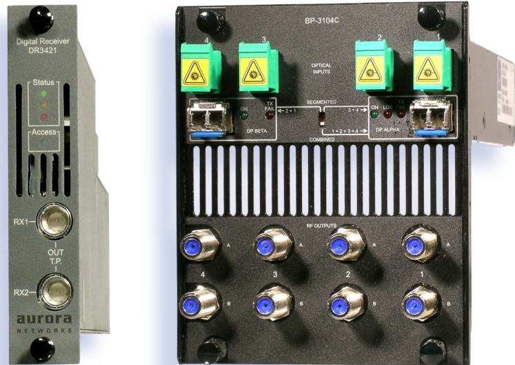
DR3421 Dual Return Channel Associated BP-3104C-AS Optical Receiver Back Plate Digital Receiver (supporting up to four dual receiver modules)

The DR3421 Dual Return Channel Digital Receiver utilizes state-of-the-art technology for digital return path applications, and its capabilities allow deployment of compact and robust high-speed digital broadband systems. The advanced design provides simultaneous conversion of digital return path traffic from two RF return segments to two discrete RF output ports. Used in combination with DT4232N Digital Transceivers in optical nodes or DT3515C Digital Transmitters, the DR3421 allows quick and cost effective doubling of the amount of return bandwidth available from any node in the network. These dual-segment digital return receiver modules are primarily used in traditional HFC systems, where larger node sizes are the norm. Two dual-channel transceivers, when used in a fully segmented node in combination with DWDM techniques, and two DR3421 dual-channel digital return path receivers can provide four discrete return paths from a single node location over a single return fiber.